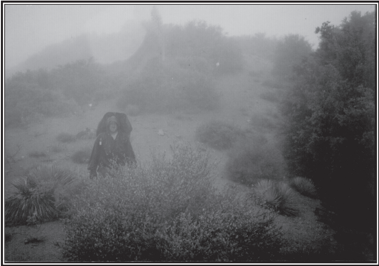
(Mt. Markham, summit trail)