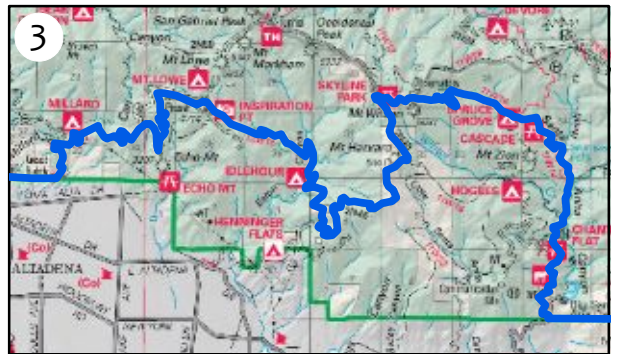
Los Angeles River Ranger District, Front Country