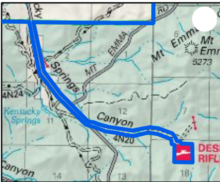
Desert Marksman Rifle Range