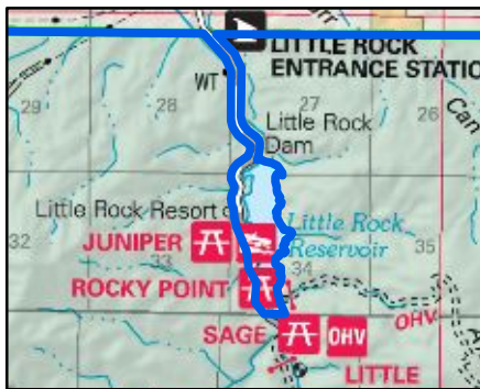
Little Rock Reservoir